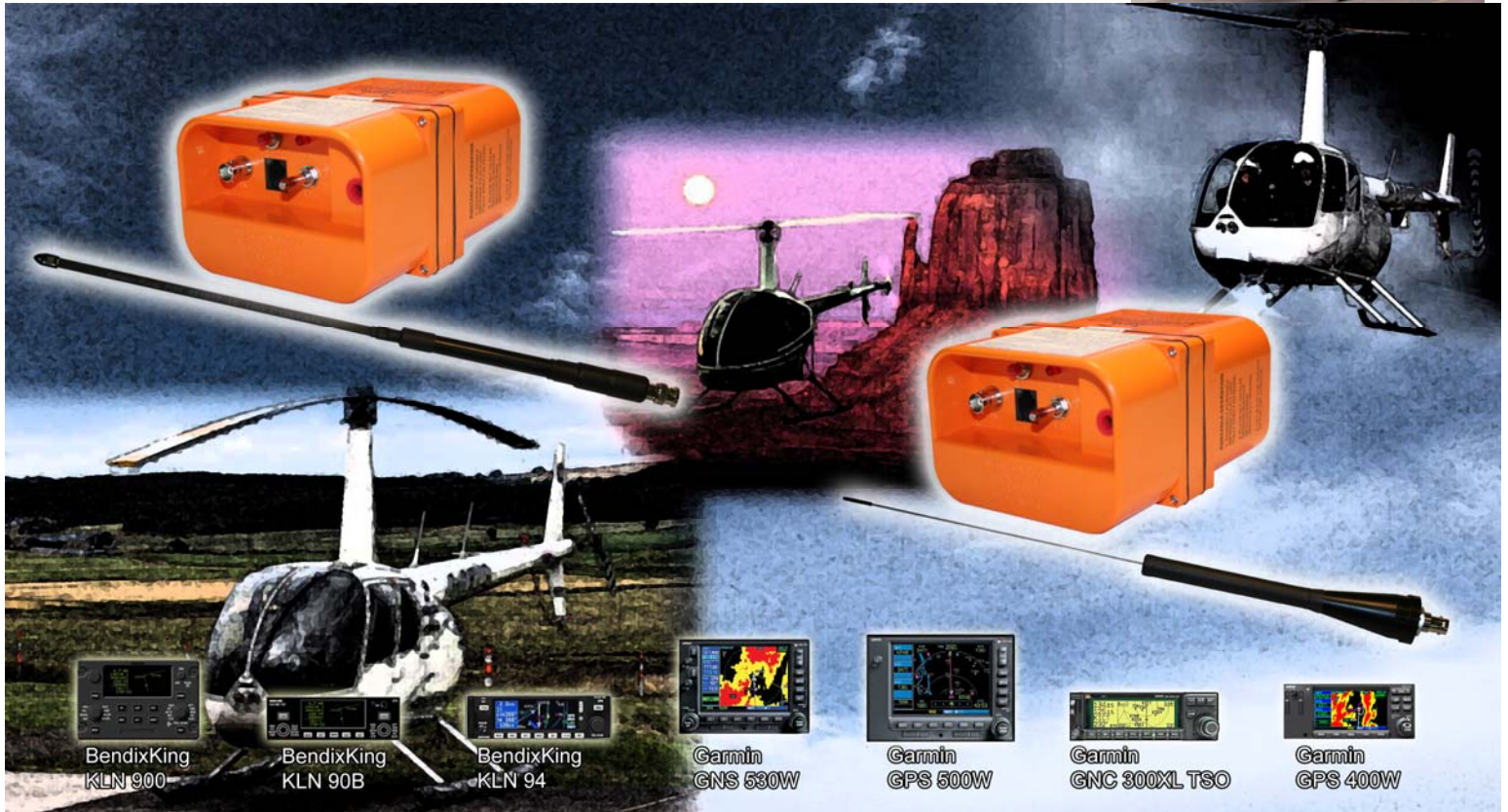
BendixKing KLN 900