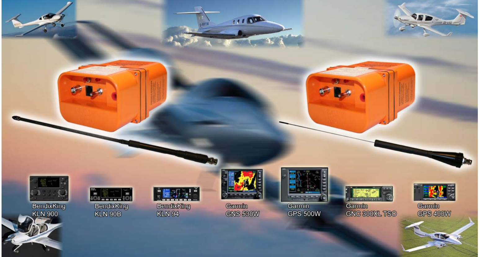
BendixKing KLN 900