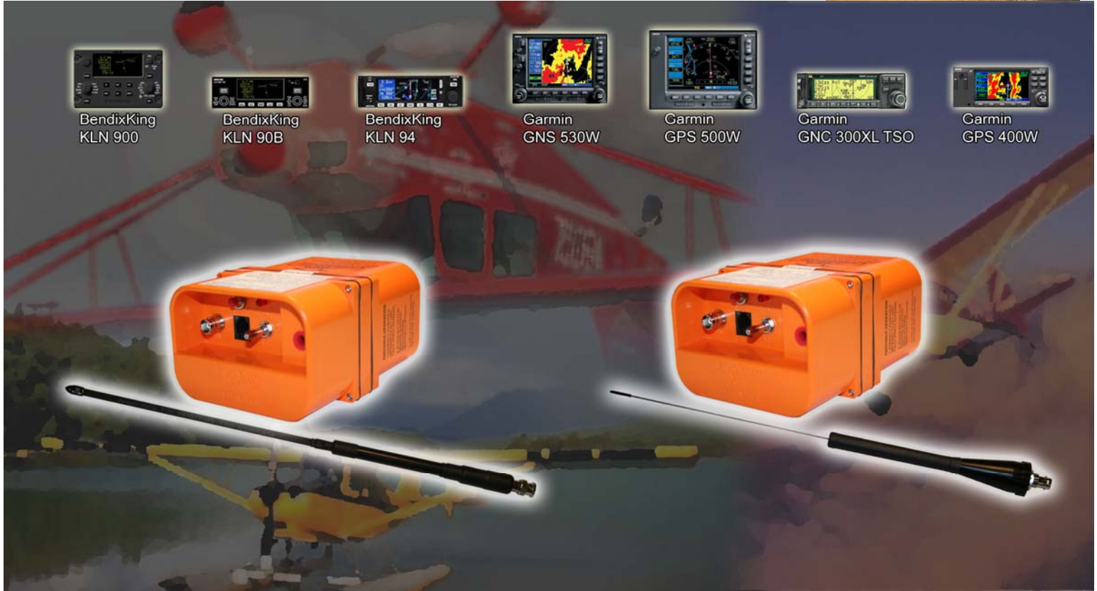
BendixKing KLN 900